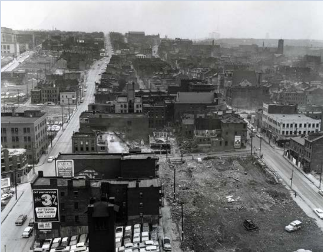
Lower Hill District